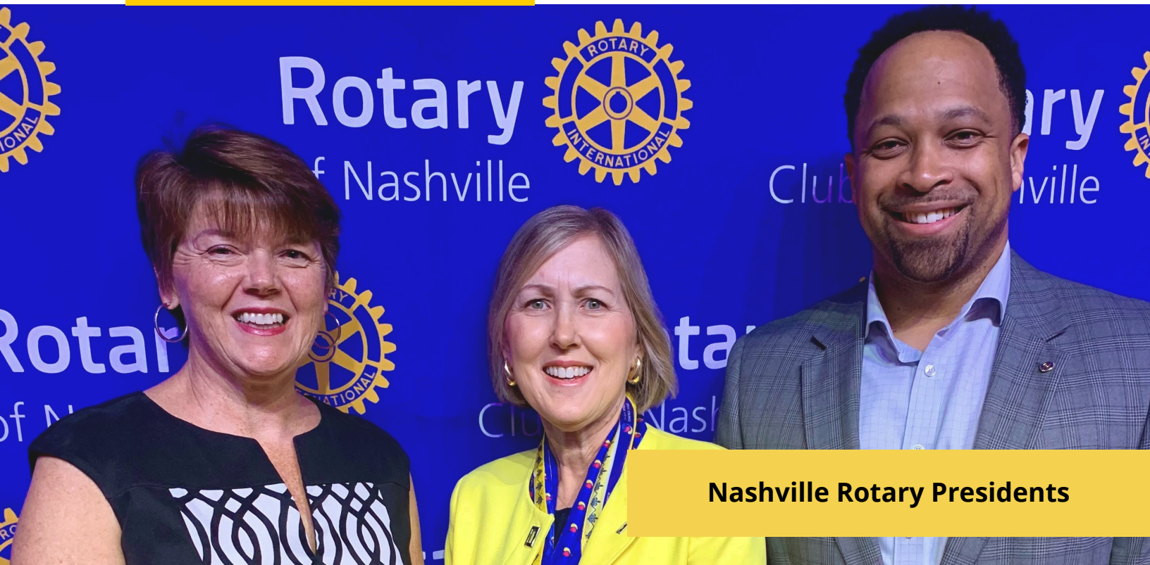
Nashville Rotary Presidents